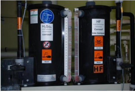
CSS, Automatic chemical consumption monitoring